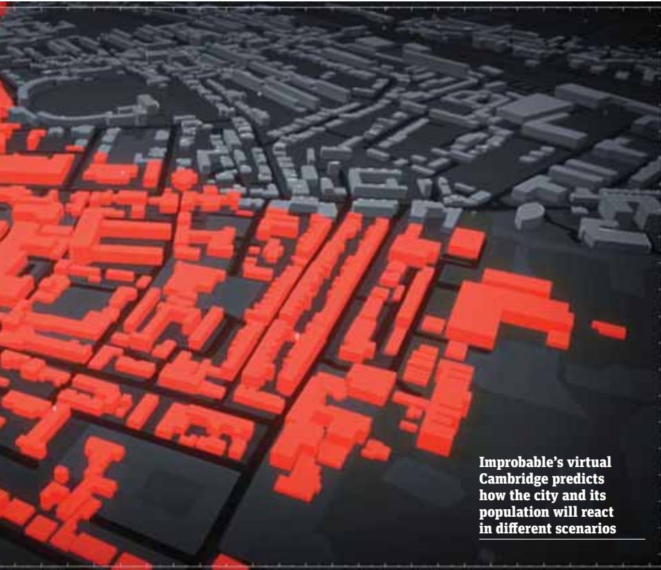
Improbable's virtual Cambridge predicts how the city and its population will react in different scenarios

make a big difference. Virtual worlds will become our collective “what-if” machine, before we try things in the real world.”