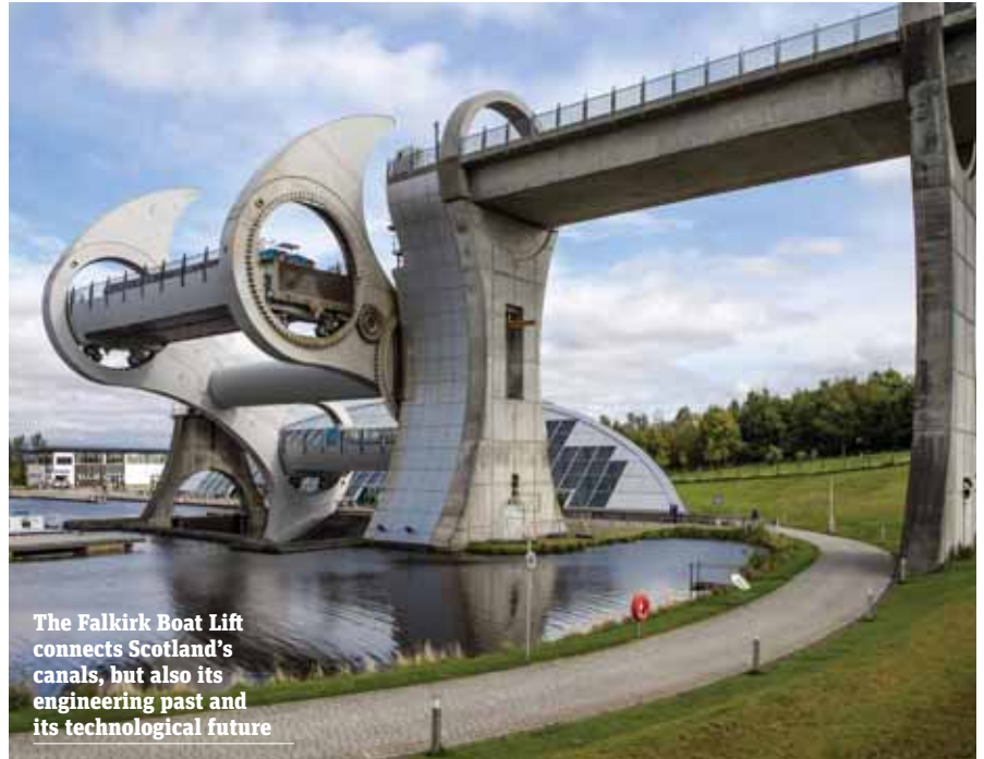
The Falkirk Boat Lift connects Scotland's canals, but also its engineering past and its technological future

must be measured not only by wealth creation but by prosperity and equality across class and geography as its main purpose. The more equal a society is, the more secure it is.